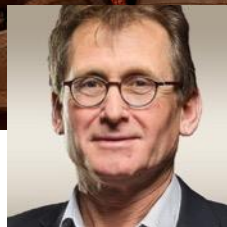
Ben Feringa U. Groningen